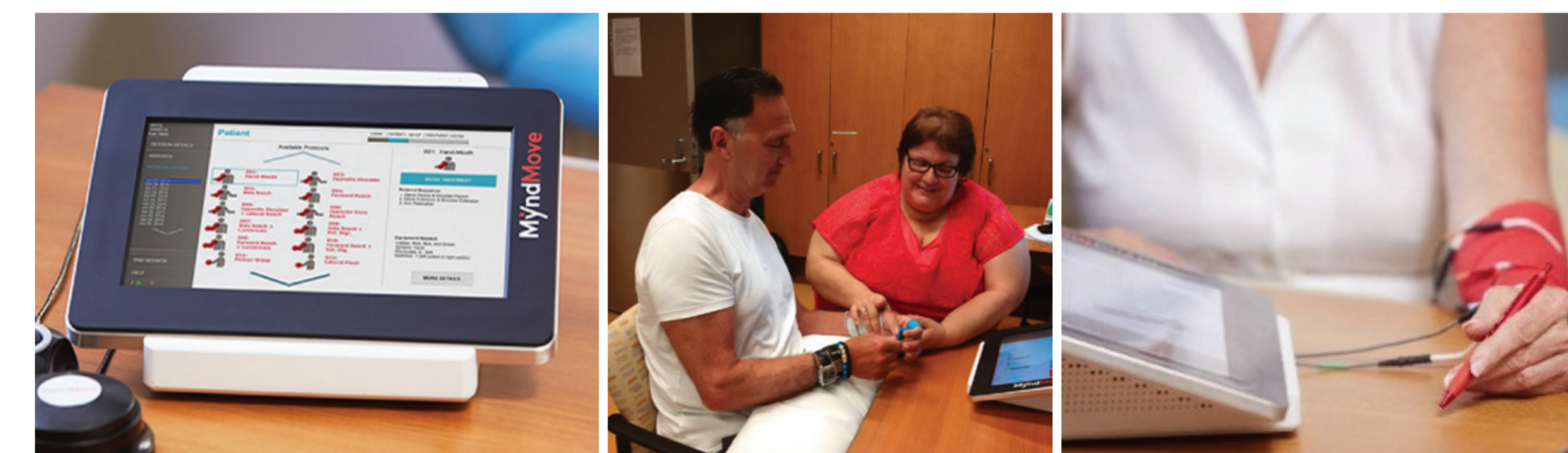
Figure 1: MyndMove Device and examples of activities performed during MyndMove™ Therapy

MyndMove™ devices offer 17 different MyndMove™ stimulation protocols to treat proximal and distal deficits of the UE in stroke patients. MyndMove™ protocols provide bursts of short electrical pulses using surface electrodes and proper sequencing to produce muscle contractions and achieve a range of reaching and grasping functions. During each session, a MyndMove™ trained occupational or physical therapist administered 1 to 4 protocols which matched the needs and goals of the patient during the hour session. Participants were encouraged to use their limbs to do functional tasks during the course of the therapy and were given homework to sustain gains made with the device between sessions. 3